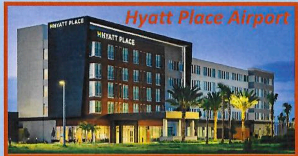
Hyatt Place Airport